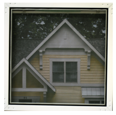
Charcoal Aluminum Screen