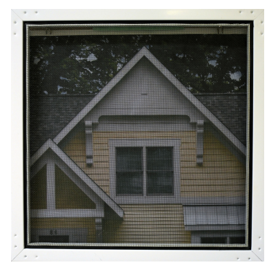
Clear Advantage Screen