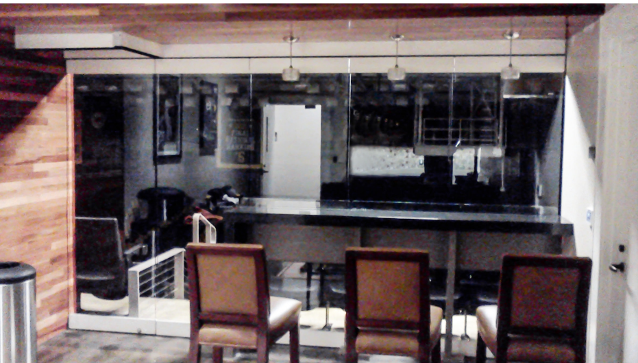
VCU SIEGEL CENTER