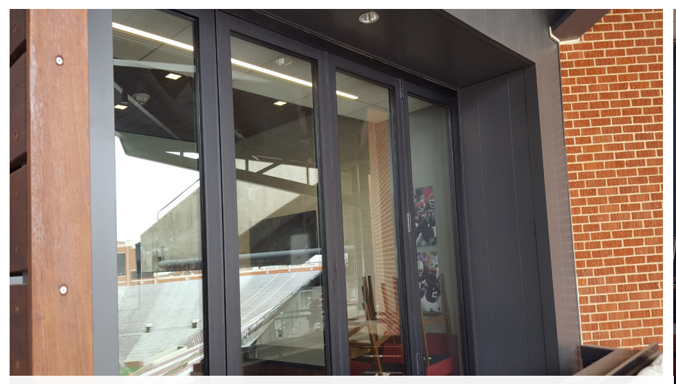
UNIVERSITY OF OKLAHOMA