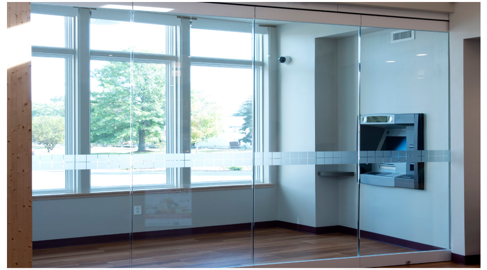
SAVINGS BANK OF WALPOLE