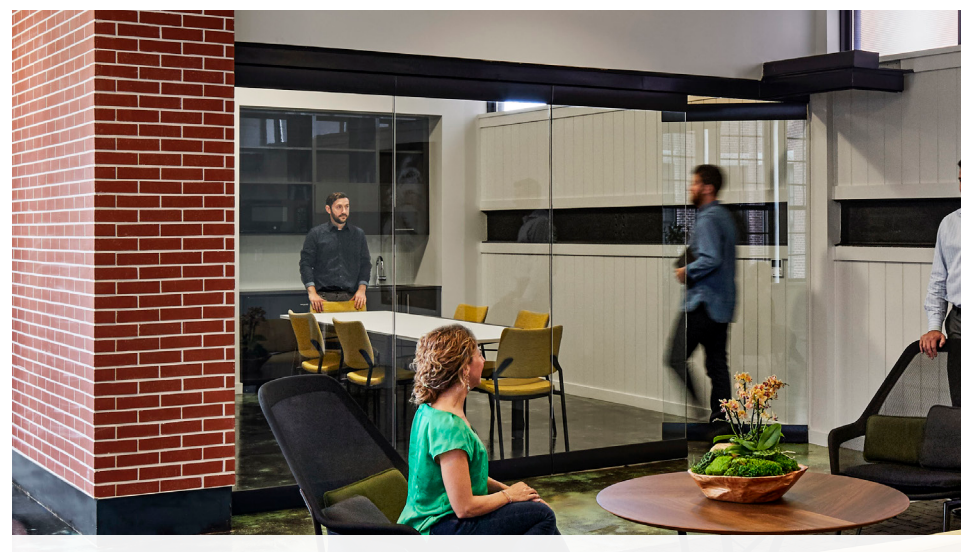
SHARPE BUILDING AT THE FOUNDRY