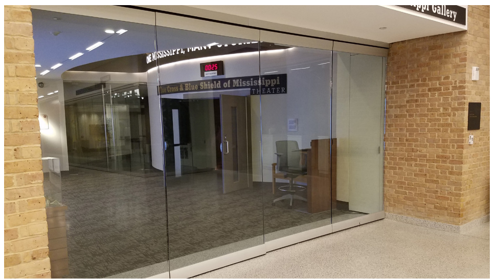
MISSISSIPPI CIVIL RIGHTS MUSEUM