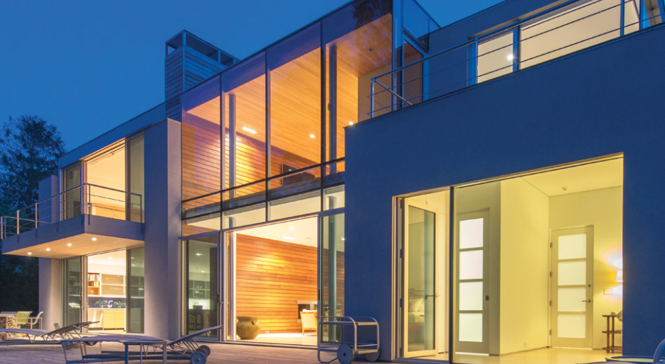
NEW YORK RESIDENCE