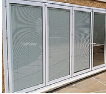
BLINDS BETWEEN GLASS

This is a special glass combination where blinds are placed in the air space of an insulated glass unit. The blinds can tilt and be pulled up/down. There are several colors available for the blinds. Strong glares and heat transmittance is reduced with blinds between glass