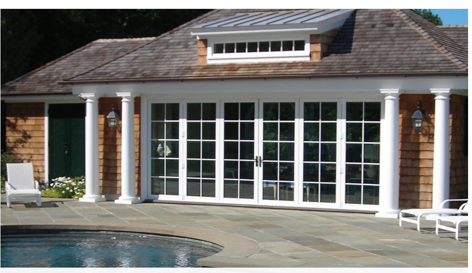
NEW YORK RESIDENCE