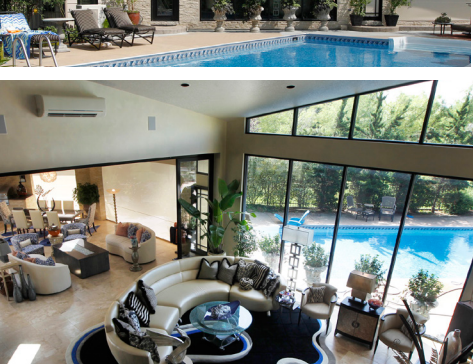
GLASS SQUARE FOOTAGE