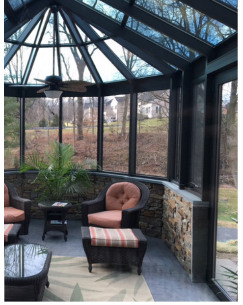
GLASS SQUARE FOOTAGE