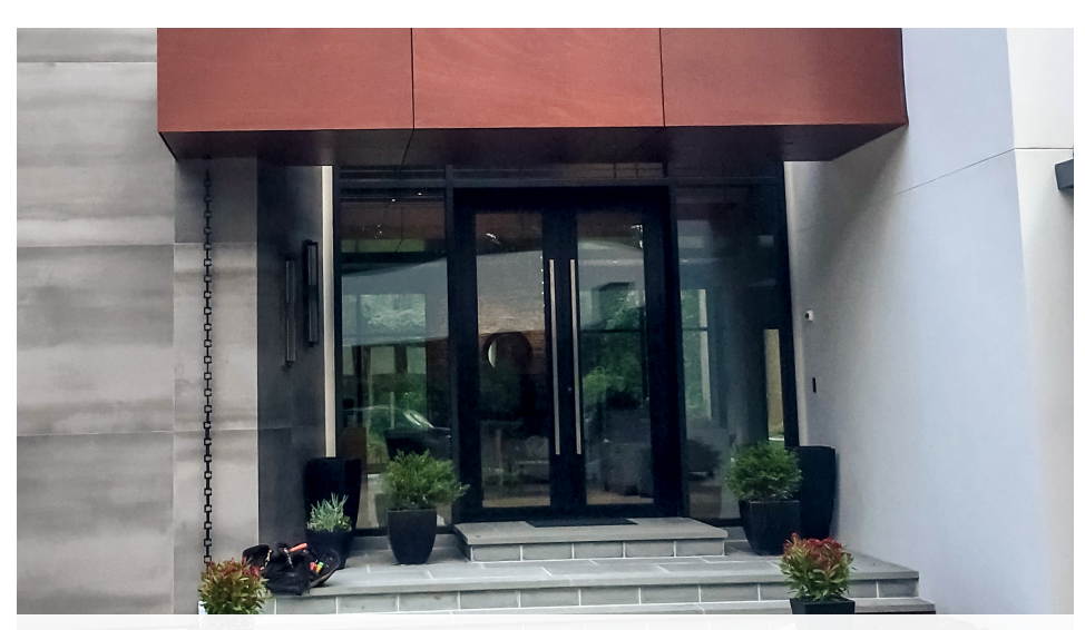
NEW JERSEY RESIDENCE